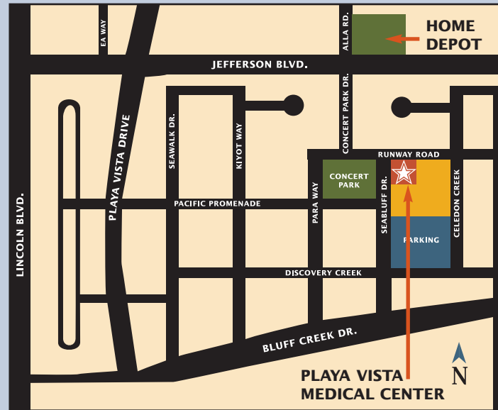
CONVENIENTLY LOCATED AT CONCERT PARK IN PLAYA VISTA

Call Playa Vista Occupational Medicine: 310-862-2800 for further information.